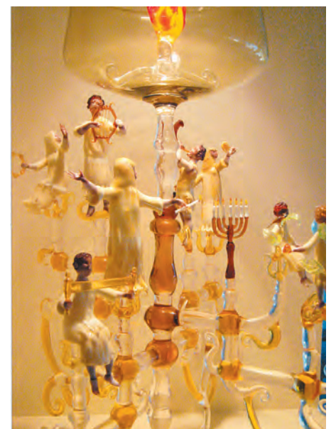
The Denny commissioned a piece by Lucio Bubacco of Italy to capture the Jewish holidays. The lighting of the Sabbath candles, blowing of the shofar and reading of the Torah are depicted.

For details regarding the major glass exhibitions, go to www.contempglass.org .